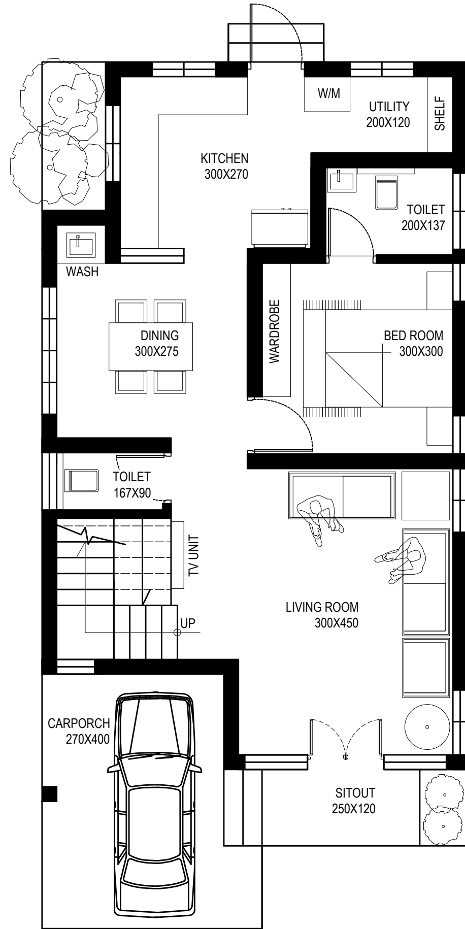
GROUND FLOOR PLAN GF AREA - 768 SQFT CAR PORCH AREA- 123 SQFT